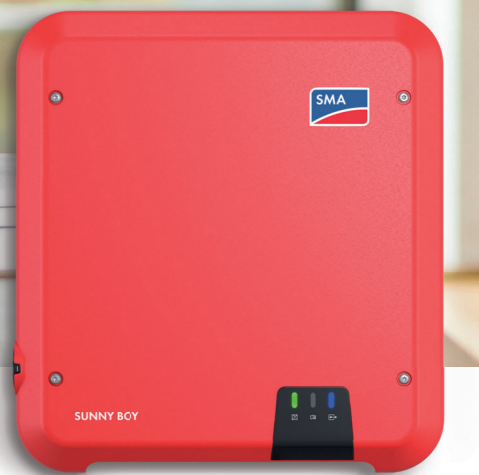
SUNNY BOY 3.0-6.0